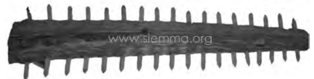
b) P. pristis . Magdalena Department. 20 pairs of teeth.