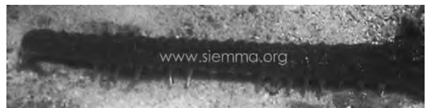
d. P. pectinata . Bolívar Department. 29 pairs of teeth. Livespecimen.