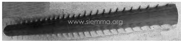
b. P. pectinata . Magdalena Department. 28 pairs of teeth.