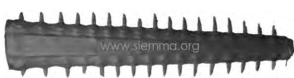
a) P. pristis . Magdalena Department. 17 pairs of teeth.