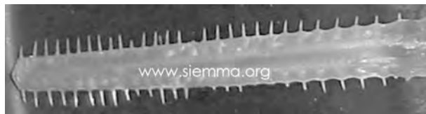
c. P. pectinata . Bolívar Department. 29 pairs of teeth.