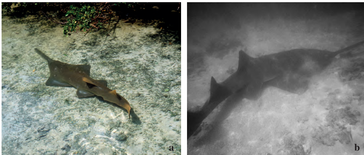
Figure 5. a) Last living specimen of Pristis pectinata from Colombia, photographed in December of 1989 at the Oceanario Ceiner, San Martín de Pajares Island, Islas del Rosario Archipelago. b) Photographed in November 2013.