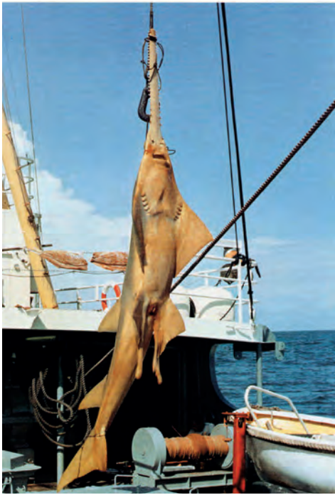
Figure 3. Pristis pectinata . South of Trinidad (= Gulf of Paría), Delta Amacuro state.

In Venezuela more records (12) were found than from Colombia, and the species probably were sympatric as well. Records date from 1925 (Gulf of Venezuela, Schultz 1949) to 2011 (Lago de Maracaibo, Barboza 2011), and as for Colombia, the recent records are actually of older reports of specimens that have probably disappeared. Both species were distributed from Lake Maracaibo to the Orinoco Delta, including Margarita Island for P. pectinata (Table 1, Figure 4).