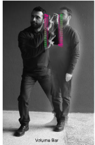
Figure 3. Volume Fader.

Defining the Visual: Volume Fader is an changing element which allows the change of movement or the voice. Soundpainter steps the imaginary box which is in front of her/him by one arm s/he creates a volume control bar and with the other hand s/he makes tampering with control bar (Figure 3).