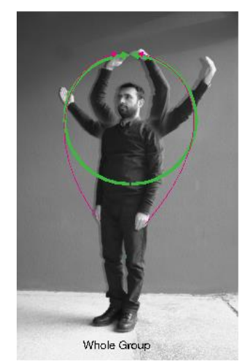
Figure 1. Whole Group.

Visual Relations: It is seen that two hands located as a full-circle format up to the head. Considering the way of arrow, hands position coming from closed both sides and to the present position. Head is in the middle and looking across (Figure 1).