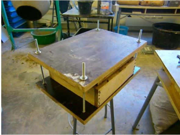
Fig. 1. Mould for compression

Third mould is filled with remaining material by filling in layers and tamping, a plywood plate is put on top, but no extra pressure is added. For the second part of the test only first two stages are used, as samples without any pressure showed poor results.