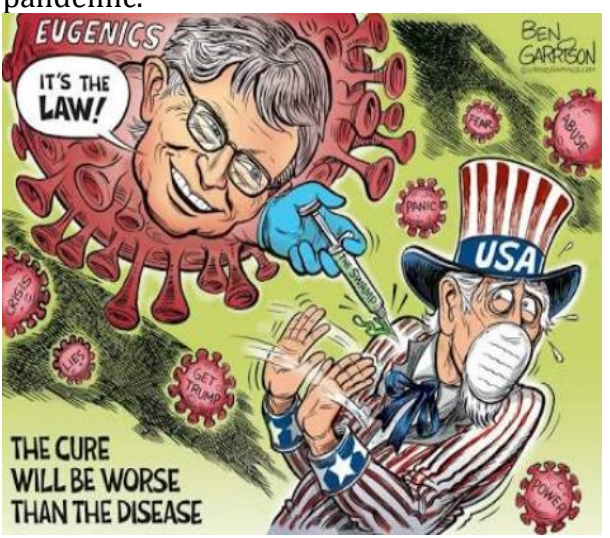
Fig. 1: Bill Gates and USA

These sample memes are delegated based on its similar signifiers to whole 16 memes found in Reddit. Undescribed memes contain similar patterns such as Bill Gates and vaccines or he as mastermind behind COVID-19 pandemic.