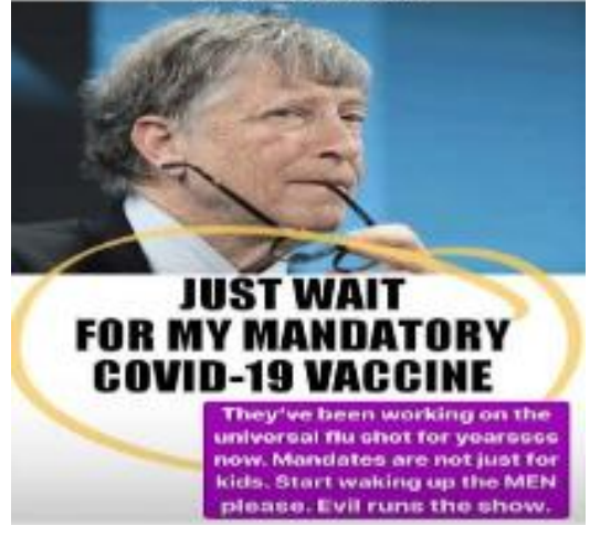
Fig. 5: Bill Gates and mandatory vaccines

In this meme, accusation of COVID-19 mastermind clearly refes to Bill Gates through written signifiers marked by possession form in phrase my coronavirus . The other signifiers like my mandatory COVID-19 vaccine reflect that opportunis impression also refers to him to persuade public in thinking that only business expansion is the motive. The assumption emerges because to sell vaccines, there must be viruses firstly. Connotation is evoked by negative manifestation in the meme.