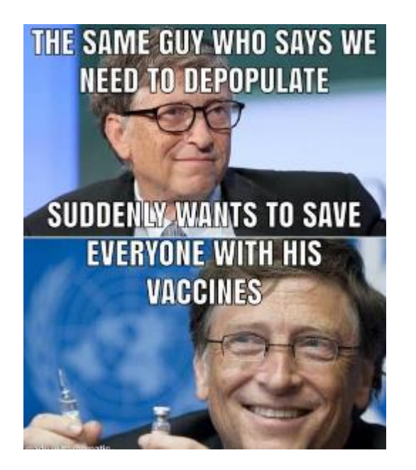
Fig. 4: Bill Gates and vaccines

to find COVID-19 vaccines. Connotation in this meme contains negative manifestation.