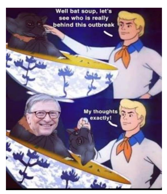
Fig. 2: Bill Gates behind Outbreak

Although this meme is cartoon version of a real figure, the essence of internet memes are marked by visual and verbal interplay to propose or counter opinions (Wiggins, 2019). This meme produces visual and written signifiers that frame Bill Gates position and what he does to his environment. Signifiers found visually are vaccine, small viruses, Bil Gates' big virus, and the United States in an old man image. The viruses represent conspirary between Bill Gates and crisis, lies, power, abuse, etc. to create new worse condition in the Unites States. Thoses viruses also connect Bill Gates with a commune with same form as virus. Same form can reflect same vision in this context. Other signifiers that emerge tend to decrease credibility of Bill Gates such as the cure will be worse than the desease. Signifieds of this data decline positive image of a public figure because this meme only focuses on negative manifestations of Bill Gates related to his concern involving COVID-19 problems. Connotation reflected by signifiers refers to negative connotation