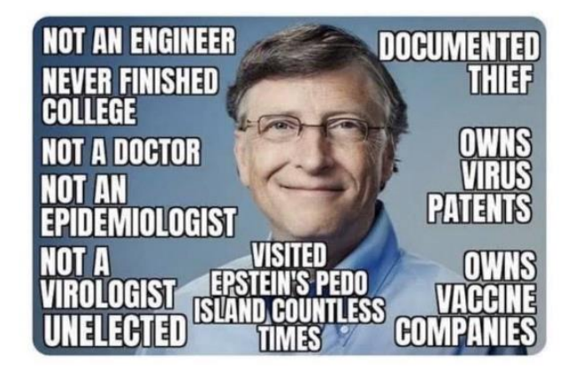
Fig. 3: Bill Gates and his background

are involved in a construction of meaning. Those are visual signifiers that can inform an opinion related to COVID-19 issue even without the written one. Bill gates' smiling face located in bowl clarify the antagonist impression for The meme conveys some people. explicitly a man behind the pandemic namely Bill Gates by placing the face in a bowl of soup. Fred as investigator can be hoped man who emerges afterward. Connotation reflected contains negative manifestation that explicate Bill Gates as the more responsible man than a bat soup.