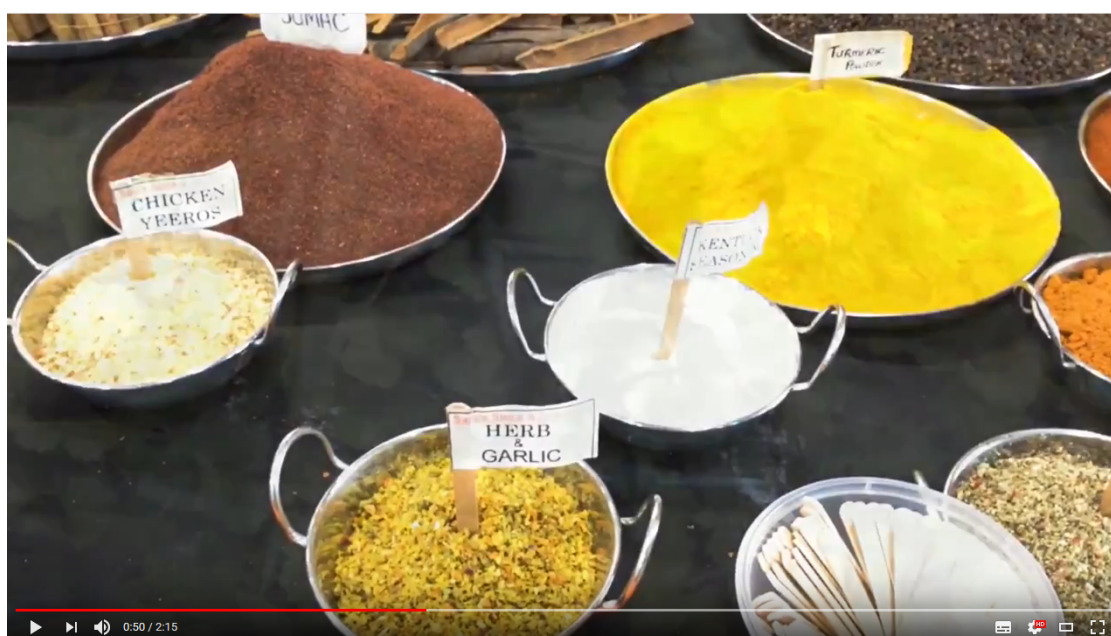
Figure 4: A screenshot from a participant's digital story hosted on YouTube.

The participant's digital stories fell within the traditional digital story format. The traditional format is digital stories a few minutes long, co-created in facilitated workshops in which participants are supported to create narratives that describe some aspect of their individual life experiences. However, despite the similarities in style, they each convey unique and personal stories. Traditionally digital stories are filmed with video cameras and edited on computers. While the storyboards were generated within the workshop, the digital stories were created using readily-available mobile technologies primarily within and outside structured workshop hours, edited using a free on-line app, and supported through online social media engagement.