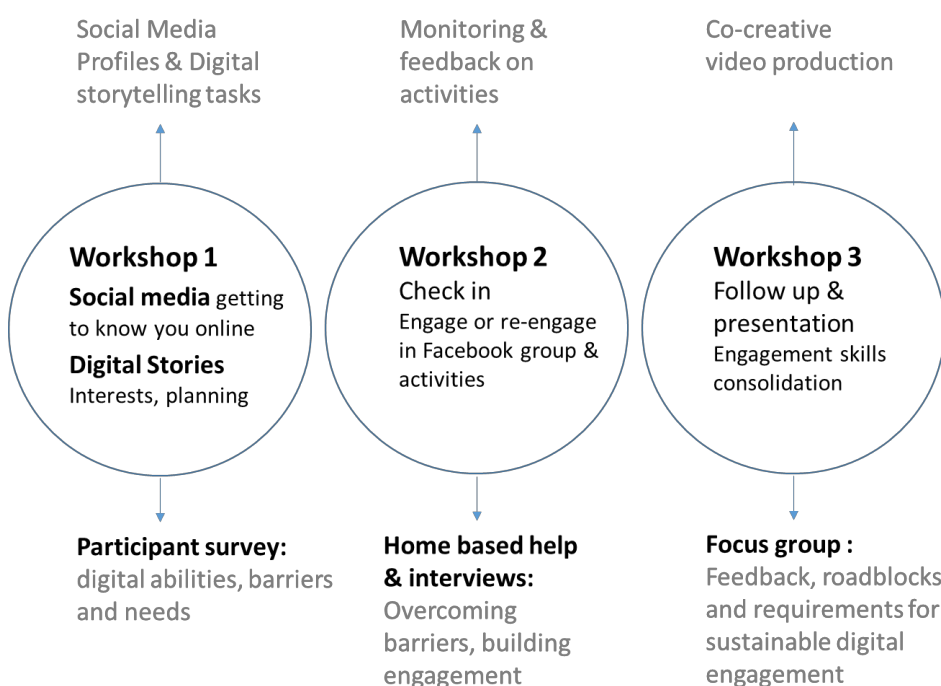
Figure 1: 60+ Online workshop series, process and evaluation methods

Three skill-building workshops were then delivered with the two groups in meeting rooms at the respective council. Workshops ran for two hours and 30 minutes, including a half hour break, and were generally divided by focus on social media skills in the first hour and digital story making skills in the second. Workshops ran across three months, roughly two weeks apart to allow participants time for between-workshop activities. Figure 1 outlines the workshop series, process and evaluation methods.