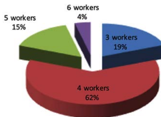
Figure 2. Number of workers in small slaughterhouses.