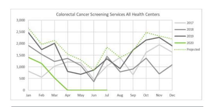
Figure 2. Colorectal cancer screening services across all health centres between January 2017 and July 2020.