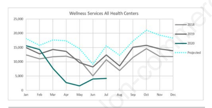
Figure 4. Wellness services utilization across PHCC health centres between January 2018 and July 2020.