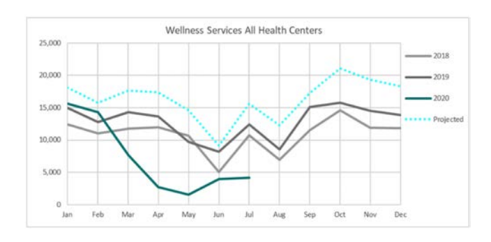
Figure 5. Tobacco cessation services utilization across PHCC health centres between January 2018 and July 2020.

distancing policy and allocating all health care professionals and the other resources to manage COVID-19 cases. 14,15