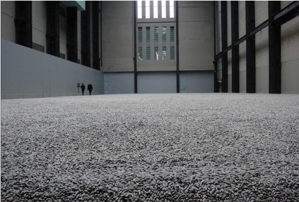
[Fig. 1]. Ai Weiwei, Sunflower Seeds (Kui Huan Zi) 2010, Tate Modern, London.

handcrafted and brushed by specialists working in small-scale workshops in Jingdezhen— Sunflower Seeds is far from industrially produced.