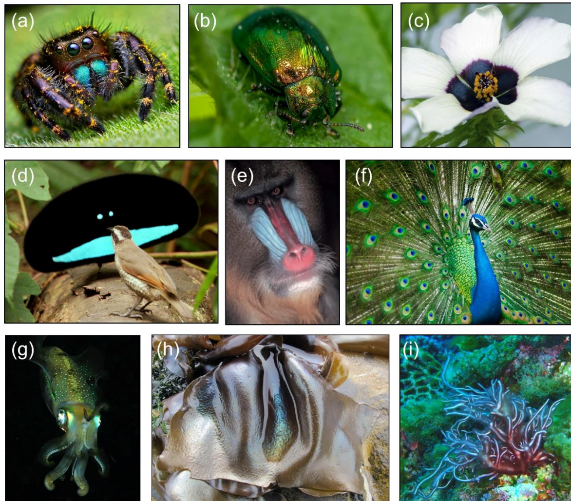
Figure 1. Examples of structural color in eukaryotes. (a) Female jumping spider Phidippus audax. (b) Dogbane beetle, Chrysochus auratus. (c) Hibiscus trionum flower. (d) Male superb bird of paradise, Paradisaea rudolphi . (e) Male mandrill, Mandrillus sphinx . (f) Male Indian peafowl (peacock), Pavo cristatus . (g) Bigfin reef squid (or glitter squid), Sepioteuthis lessoniana . (h) Red macroalgae, Iridaea cordata. (i) Red macroalgae, Trichogloea spp..

(Figure 3) and Cellulophaga lytica are known to produce vivid and iridescent coloration due to the periodic organization of their cells [18–21].