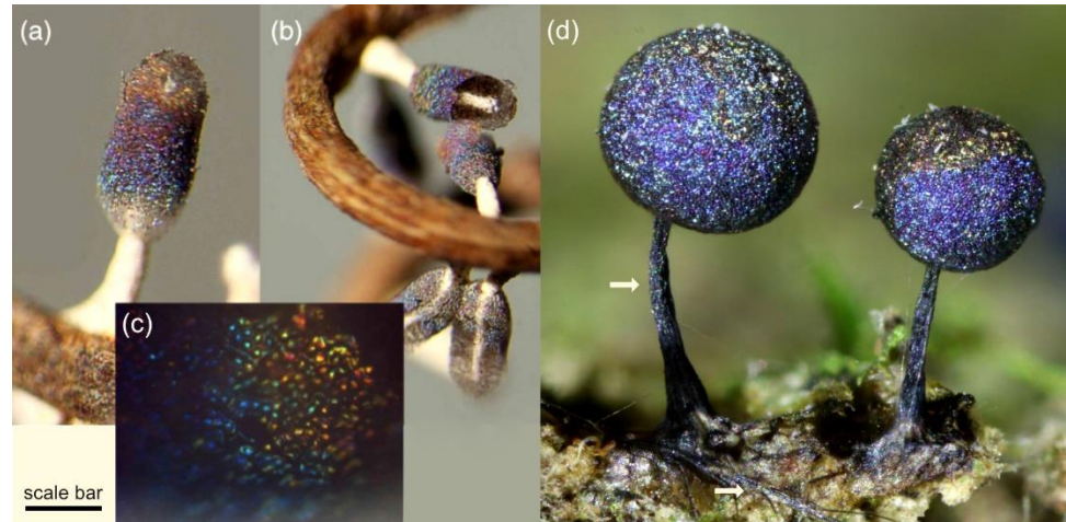
Figure 2. Examples of structural color in the Myxomycetes. (a–c) Diachea leucopoda with spores enclosed within the transparent peridium, displaying bright, iridescent, structural color. (c) A close up of the surface of the sporulating body, with individual spores visible. (d) Lamproderma sp. with iridescent sporulating bodies enclosed within the peridium but also iridescence visible on the stalk and hypothallus (e.g., white arrows). Scale bars: (a) = 1.2, (b) = 2, (c) = 0.3, (d) = 0.2 mm.

displayed by the feathers remain obscure [23]. Further, whilst some genes specifying structural colors are known in bacteria [18], it is not clear if there is any direct relevance to the fungi.