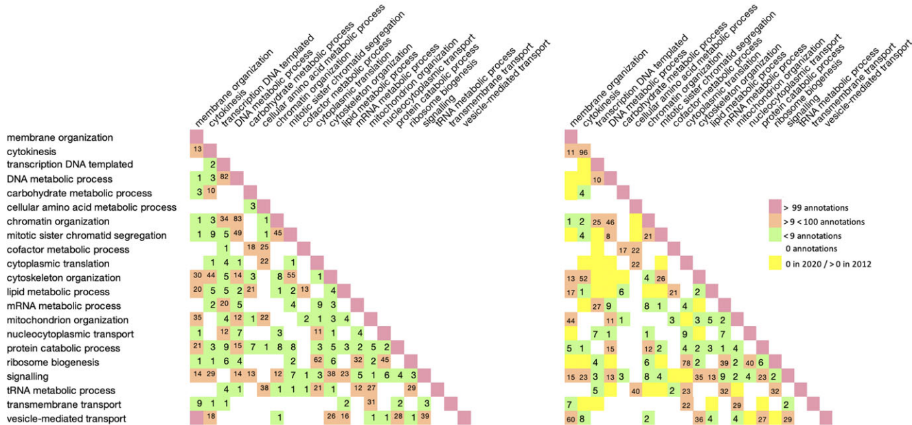
Figure 1. Annotation matrices showing fission yeast annotations for 21 selected GO term pairs in 2012 and 2020. Each row–column intersection off the diagonal shows the number of genes annotated to two different terms. Cells are colour-coded by number of co-annotated genes. Disputed phylogenetically-inferred annotations have been removed from the 2020 dataset.