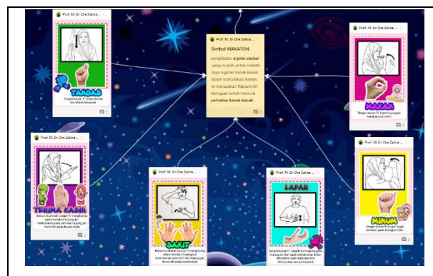
Figure 4 - How interactive materials sharing can be implemented

Figure 3 - The interface makes it easy to implement online teaching as it has some basis in regards to the Makaton Signal Integration and Augmented Reality , and it has the potential to be particularly helpful for Children with Down Syndrome