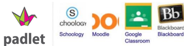
Figure 1 – Best LMS option for online learning

One of the great aspects about LMS above is that, when learning and teaching go back to face-to-face mode, the activities that take place online using the LMS can continue without much hassle.