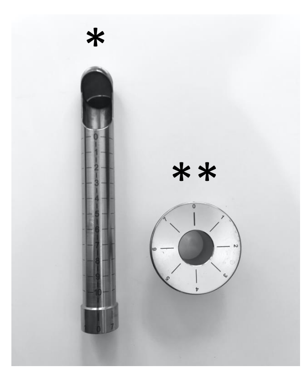
Figure 1. The figure represents the vaginal device of the laser. * Vaginal probe, ** graduated guide.

Laser treatment was performed using an intravaginal non-ablative CO_2 laser (V-Lase<sup>®</sup> Lasering, Modena, Italy); this device is composed by a metal probe that is inserted into the vagina through a graduated guide positioned at the level of the vaginal introitus (Figure 1).