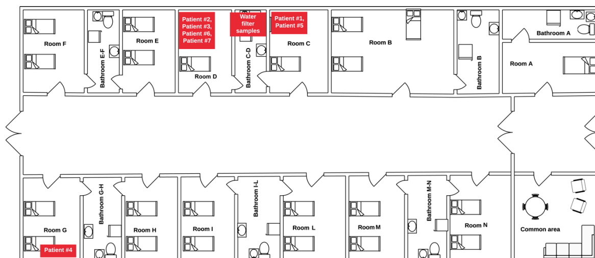
Figure 1. Floorplan of the hematology unit. Six of the reported cases clustered around rooms D and C, which share a bathroom where environmental isolates were collected. One case was detected in a patient from room G.

Unfortunately, the patient remained persistently febrile despite receiving 18 g of piperacillin/tazobactam by continuous infusion for >48 h. After switching the patient to 2 g of meropenem every 8 h administered in 6-h infusions plus amikacin 15 mg/kg/day, he improved rapidly and was discharged home without complications.