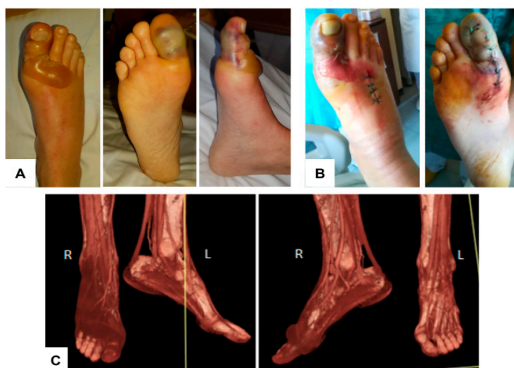
Figure 2. Clinical presentation of P. aeruginosa necrotizing fasciitis. (A) The small skin lesion rapidly evolved into blisters; (B) Appearance of the foot after open drainage attempt; (C) Computed tomography (CT) examination of the legs with volume rendering post-processing reformatted images showing the presence of pathologic tissue encasing the vessels, tendons, and muscles of the dorsal region of the right foot and ankle. Only the first toe is involved, while the others are spared.