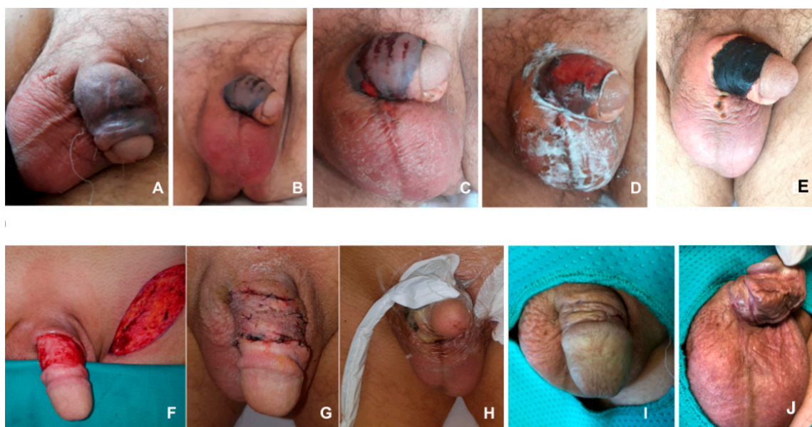
Figure 3. Clinical presentation of P. aeruginosa Fournier's gangrene. (A–D) Evolving infection of penis and scrotum; (E) Development of a dry necrotic dorsal eschar; (F) Debridement of necrotic tissue of the penis shaft and full thickness skin taken from left inguinal area; (G) Full thickness skin grafted on the soft tissue loss; (H) Negative pressure dressing positioned over the skin graft to improve skin graft take (I,J).