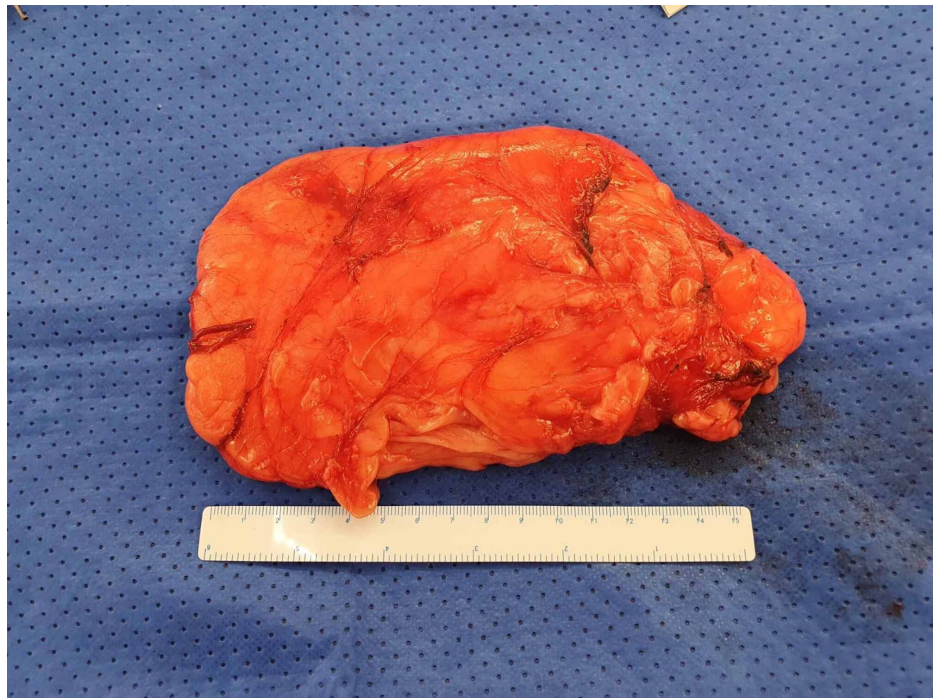
FIGURE 3: Excised specimen demonstrating a large well-circumscribed mass measuring 160mm x 90mm.

The small hernia defect was primarily repaired with nylon sutures, as a synthetic mesh was deemed unnecessary and at a high risk of infection should a seroma develop. She was discharged home the next day with an uneventful recovery. Subsequent histology findings demonstrated mature adipose tissue, without any evidence of malignancy, confirming the diagnosis of a simple lipoma.