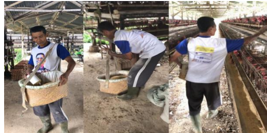
Figure 1. Feeding in husbandry

Animal feeding activities still consider human labor to be an essential role. Based on the results of interviews with workers, found obstacles for workers in the process of animal feed is carried out using a sling made of cloth and baskets with weights \pm 20 kg and distance of \pm 400 meters with repetition 2x a day ie at 07.00 WIB and 13.00 WIB. This results in losses not only to the workers themselves but also to the owners of the company itself. These losses include complaints felt by workers, the feeding process that requires a long time, and the amount of chicken that is wasted. Staff feel discomfort in back, neck, and arm, Between productivity and safety and health are explained by four factors[1]: need for more innovative ways to reduce the high rates of workplace injury and illness, pressure to reduce social and economic costs of injury and illness, need to improve labour productivity without workers needing to work longer hours and/or taking on more work, and need to offer good working conditions as an enticement to recruit and retain skilled workers in tight labour market.