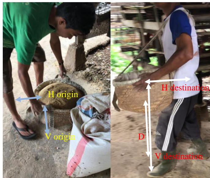
Figure 3. Process for appointing manuals for feeding livestock