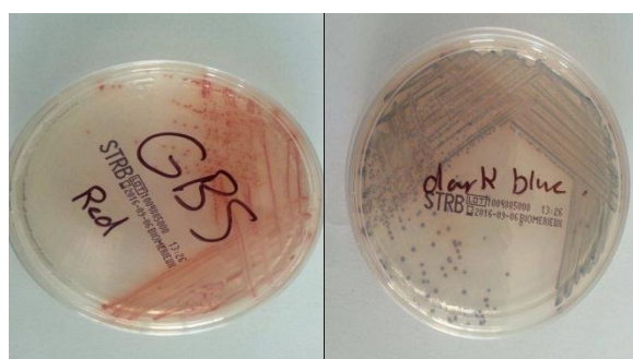
Figure 1 Appearance after 24 h incubation of (A): Streptococcus agalactiae (Group B Streptococcus (GBS)) and (B) Enterococcus faecalis on Strepto B ID® chromogenic agar

Direct plating was carried out by inoculating the swab that was inoculated in Amies transport medium onto chromID Stepto B agar. The ChromAgar plates were incubated at 37°C for 18-24 h in aerobic conditions. The chromogenic selective medium is supplemented with three chromogenic substrates to optimize the identification of GBS, which appears red colonies that are round and pearly after 18-24 hour incubation Figure 1.