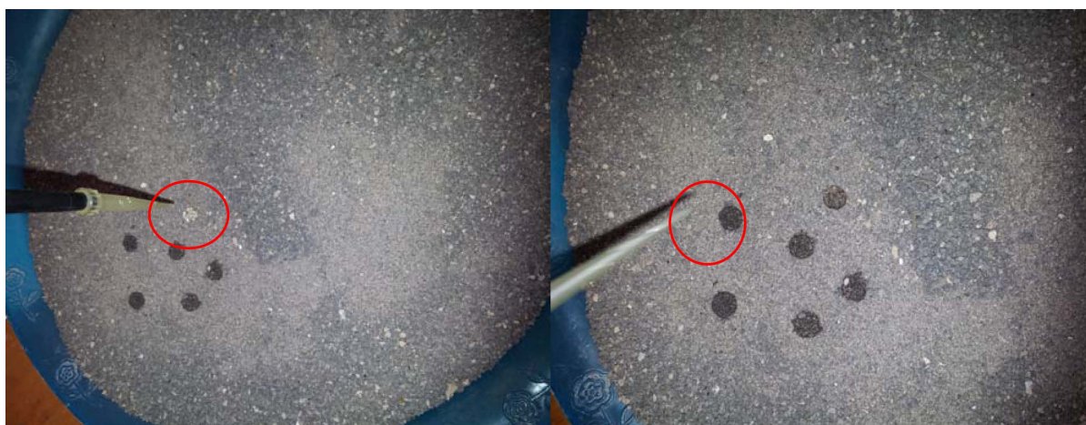
Figure 1. Water drop penetration, left photo shows water drop at time zero, right photo shows penetrated drop.