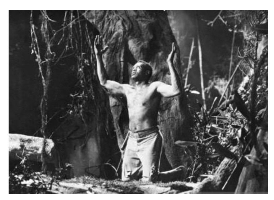
Fig. 2. Robeson, as Jones, in supplication, The Emperor Jones, screenshot, United Artists, 1933.

highlighted by his display of his naked upper body (fig. 2). The audience especially "sees" this conflict when Jones escapes from his pursuers in the final act of the film, where Robeson dramatizes the haunting experiences of being African American in contrast with the beauty of his body and voice in demonstrative supplication.