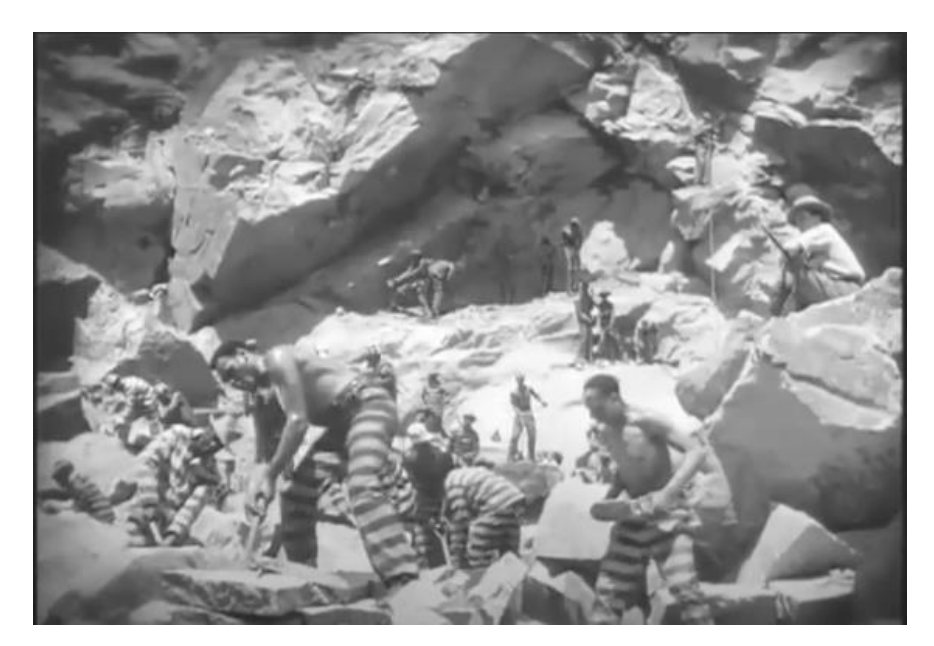
Fig. 4. Robeson (center-left) as Jones, at prison-labor camp, The Emperor Jones, screenshot, United Artists, 1933.