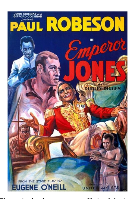
Fig. 1. Theatrical release poster, United Artists, 1933.

Robeson was not merely gifted with performance and words, but also with ideas. Philosophy, culture, and politics all intersected in his performative imagination in powerful ways. While his intellectual curiosity was perhaps camouflaged by his personality or his philosophical contemporaries, Robeson conceived and portrayed himself as an artist of cultural, social, and political ideology.