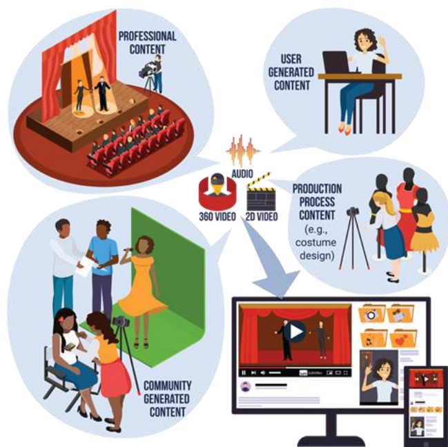
Figure 1: Sketch diagram of the Media Vault

geographical area at edge locations to ensure data is always available in closest-possible proximity to end-users. Caching of the data also minimises direct reads at the file storage system, thereby reducing cost.