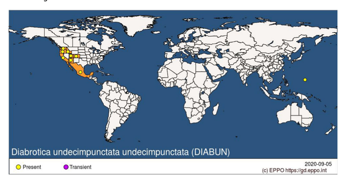
Figure 2: Global distribution map for Diabrotica undecimpunctata undecimpunctata (extracted from the EPPO Global Database accessed on 25 September 2020

North America from Canada to Mexico. The distribution of the subspecies D. undecimpunctata undecimpunctata is limited to the southwest of this area (EPPO, 2020). The current distribution is provided in Figure 2 and Table 2.