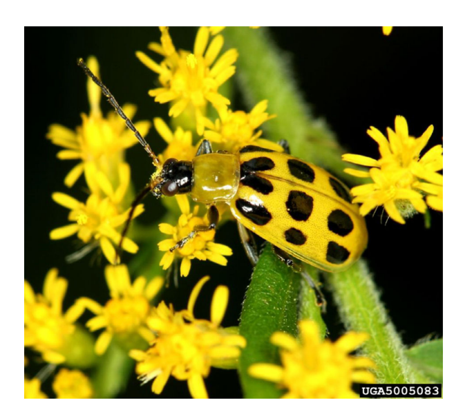
Figure 1: Adult Diabrotica undecimpunctata undecimpunctata.

<u>Pupae</u>: Pupae are exarate adecticous, whitish and 6 mm long. They are found in earthen cells in soil near plant roots (Alston and Worwood, 2012; Arant, 1929).