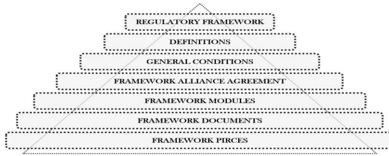
Figure 1. Hierarchical relationship among FAC-1 documents.

The provisions contained in the General Conditions and Annexes may be departed from or modified in the FAC-1, which is composed of several Modules, specifying respectively: