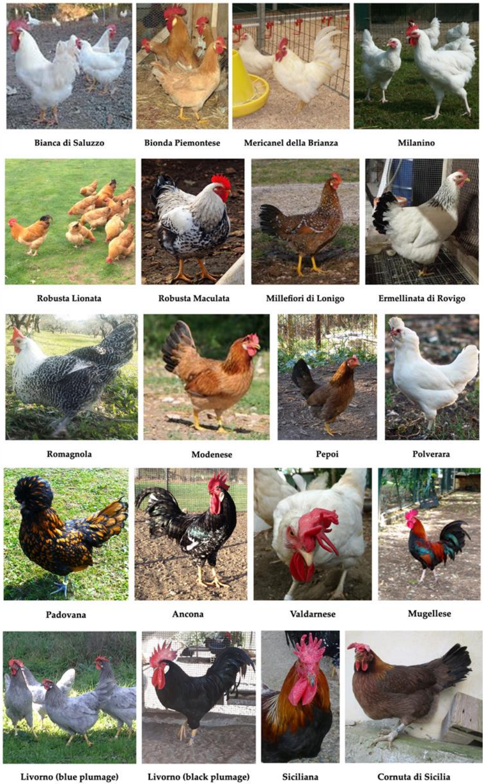
Figure 2. Main Native Italian chicken breeds.