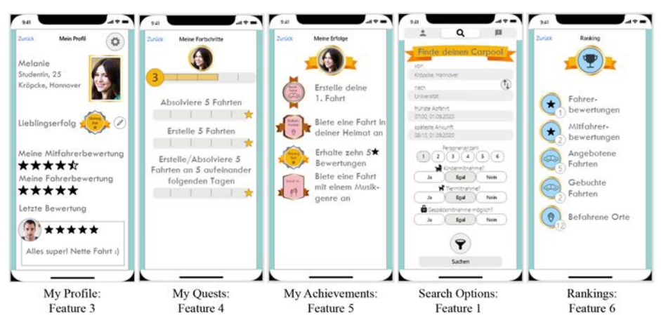
Figure 2. Prototype screen examples