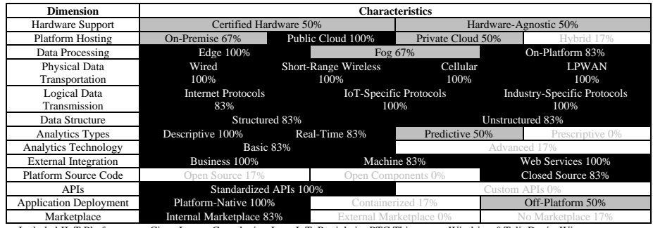
Included IIoT Platforms Cisco Jasper, Cumulocity, Itron IoT, Particle.io, PTC Thingworx, Windriver&Telit DeviceWise

Connectors are IIoT platforms that specialize in integrating devices into their platforms to extract and gather data. They put stronger restrictions on hardware support or only offer standardized APIs to comply with the technological complexity and provide a reliable basis for additional contributions of platform actors. As their focus is on these topics, they rely on other services and solutions to make use of the data and provide advanced analytics tools, which other users can adopt through the marketplace.