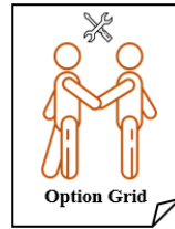
Figure 2. Engagement tool symbol for an adaptable Option Grid in the form of a document 2

Additionally, further information to the user should be depicted in an extra view named “details”, which opens when clicking on the patient engagement tool symbol. A practical example is given in the following section by applying the integration of QPSs in patient pathways to the oncology use case.