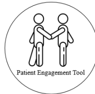
Figure 1. Symbol for patient engagement tool 1

The symbol proposed for the representation of patient engagement tools in patient pathways is depicted in Figure 1. It can be connected to the element in the patient pathway using a dotted line.