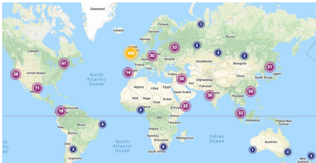
Figure 2 SURE_J downloads from September 2019 to September 2020.

The SURE Network Journal, SURE_J ( http://sure-network.ie/journal/ ), launched its first issue in 2019 with five papers published following a rigorous peer review process. All papers in the first issue were based on presentations at the 2018 conference. Following the first issue, the journal has opened submission to authors reporting on their undergraduate research in the Sciences, whether presented at the SURE conference or not.