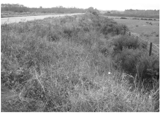
Figure 2. Rampart road on the N62 national secondary road, County Offaly, Ireland.