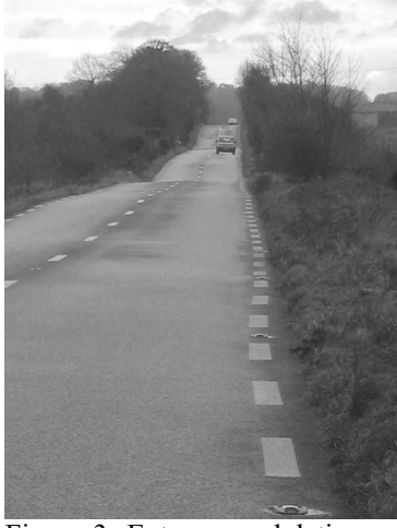
Figure 3. Extreme undulations on N62 rampart road, County Offaly, Ireland.

the road surface was level with the surrounding ground, where possible. Otherwise, abandonment of the site and the construction of a new road on firm inorganic ground were recommended if the side slopes were too steep and heavy traffic was expected.