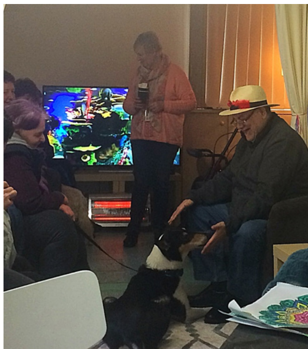
Figure 2. A participant entertained by the antics of Clancy, the smooth collie.