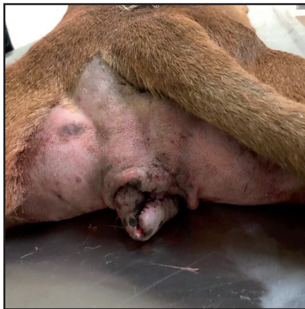
Figure 4. Reconstruction of the anatomic appearance of the vagina and vulva was performed after surgery.