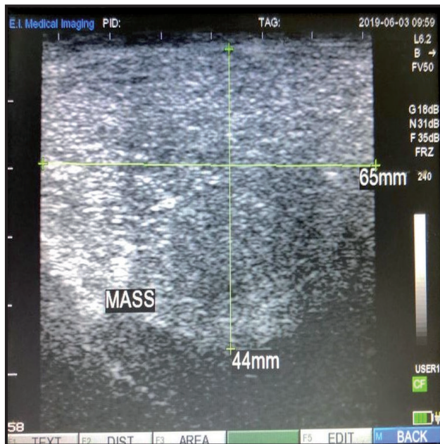
Figure 2. The transvaginal ultrasound appearance of mass with encapsulated hypoechoic.