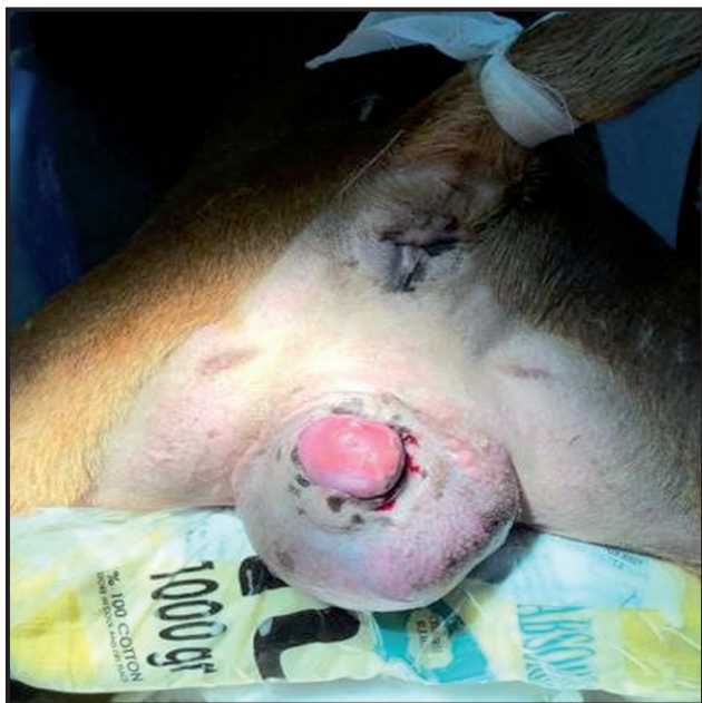
Figure 1. A 10-year-old pitbull crossbreed dog shows swelling in the perineum caused by vaginal lipoma before the surgical management.

Lipomas are defined as a soft mass of well-differentiated adipose cells among mesenchymal tumors. Leiomyomas, fibroleiomyomas and fibromas are common, while leiomyosarcomas, lipomas, mastocytomas,