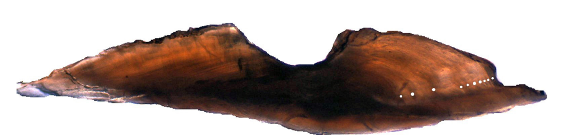
FIGURE 3. Mounted and polished sagittal otolith section of a 10 y old lionfish (Pterois volitans/miles) collected from the Flower Garden Banks National Marine Sanctuary, northwestern Gulf of Mexico, in 2018. White dots indicate annuli, determined through patterns of opaque and hyaline bands.

The ecological impacts of the lionfish invasion are concerning, as lionfish can cause substantial reductions of native reef fish (34–99% of prey–sized fish biomass) in a relatively short period (Green et al. 2012a, Albins 2015). It is unknown what impacts lionfish are having at FGBNMS, if any. Given the offshore, secluded nature of the sanctuary, absence of reef–wide monitoring, and serendipitous collection of such an old lionfish, it is clear that more investigations are necessary to construct a full age structure and to determine direct impacts lionfish may be having on native organisms in this protected region.