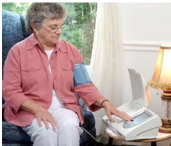
Fig 3 | Once confident with using the technology, patients can continue to operate it independently

The integration of telehealthcare into health service workflows often means adding to the roles and responsibilities of healthcare professionals. This was the case in the Columba telehealthcare initiative, w19 where extensive protected training opportunities had to be provided for staff. During these sessions, staff learnt how to use