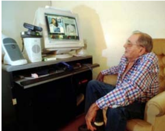
Fig 2 | Telehealthcare with video conferencing for a patient with chronic obstructive pulmonary disease

diabetes). In chronic obstructive pulmonary disease, interventions with a dedicated chronic obstructive pulmonary disease case manager have reduced the numbers of exacerbations and related admissions to hospital. 10-12 For example, in one trial, case managers provided an enhanced service during working hours, monitoring patients with increased frequency using media including video conferencing (see fig 2). In a 2003 trial of patients with chronic obstructive pulmonary disease related respiratory failure requiring long term oxygen therapy or mechanical ventilation, or both, case managers alternated physical visits to the patient's home with virtual home visits via telehealthcare to conduct reviews and reduce the need for admission. 10