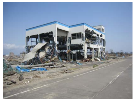
Figure 3 Photograph of tsunami destruction – Yagi Port.