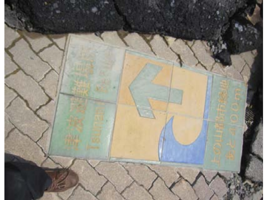
Figure 1 Photograph of tsunami warning sign.

Despite the background knowledge and precautions, the March 2011 earthquake when it occurred was much larger than predicted and, although there was little earthquake damage, the associated tsunami was much larger than many of the built defences and evacuation strategies could cope with (Figures 2 and 3).