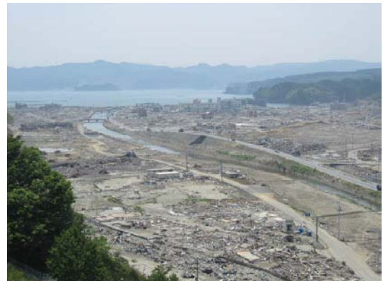
Figure 2 Photograph of destruction of Minamisanriku, northern Honshu.