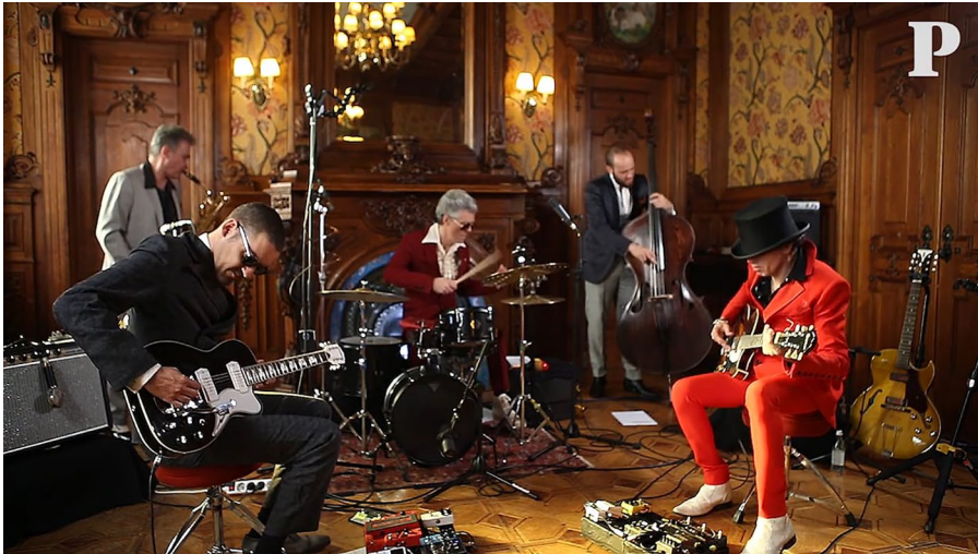
Figure 3. Dead Combo, or tradition revisited. 1

1 Image used with permission from Dead Combo.