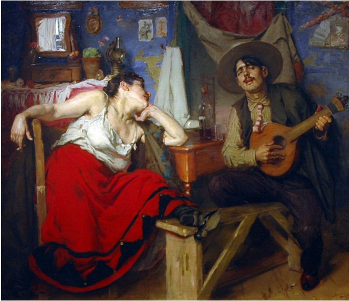
Figure 2. The tradition of Fado: O Fado, by José Malhoa (1910). 1

1 “Lisbon O fado, José Malhoa, 1910” by D-Klick is licensed with CC BY-NC-ND 2.0. To view a copy of this license, visit https://creativecommons.org/licenses/by-nc-nd/2.0/ .