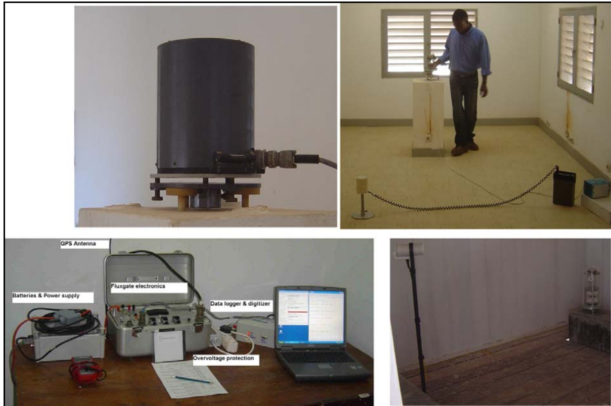
Figure 3. Typical INDIGO hardware. Clockwise from top left: The EDA triaxial fluxgate sensor in Nampula, Mozambique; Absolutes in Nampula with a Ruska DIFlux and a Geometrics proton; DMI and GEM recording magnetometers in Kupang, Timor-W; EDA console and INDIGO logger in Maputo, Mozambique.

The original objective of the INDIGO project was to make use of fifteen EDA fluxgate variometers donated to the British Geological Survey (BGS), coupled with a low power digitiser to make filtered one-minute digital daily recordings.