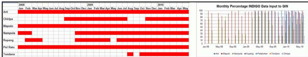
Figure 4. Data availability for INDIGO observatories. GIN stands for the Geomagnetic Information Node at Edinburgh.

The data is stored on a BGS server and is currently accessed with a password. There is also a website centralising all present and past data on the different INDIGO observatories: instruments in use, serial numbers, scale values, preliminary baselines, monthly bulletins, site plans, pictures, and history.