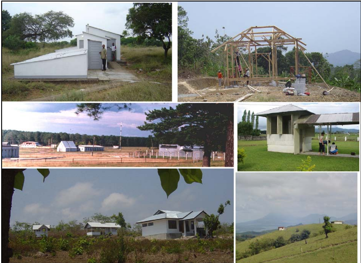
Figure 1. Pictures of INDIGO installations. Top left: Variometer house at Maputo, Mozambique; top right: the newly erected variometer house in Pelabuhan Ratu, Indonesia. Middle left: Arti observatory in Russia; middle right: the absolute house at Tondano, Indonesia. Bottom left: the new Kupang observatory in Timor-West, Indonesia; bottom right: the observatory of Chiripa, Costa Rica.