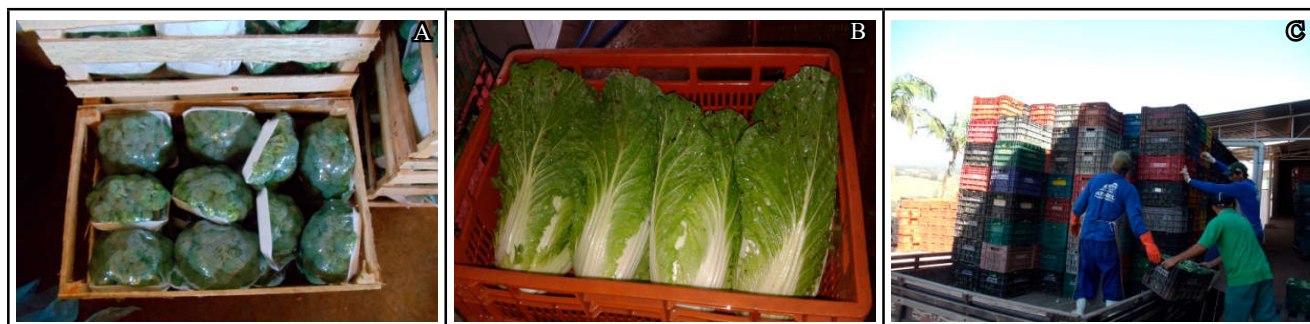
Figure 2. Broccoli (A) and Chinese cabbage (B) stored in wood and plastic boxes (C) transportation in a truck trailer. Brasília, Embrapa Hortaliças, 2019.

Transactions between growers and industry constantly seek to reduce costs and increase profitability. On the one hand, industries buy in quantity, but aim to negotiate lower values of the products, and on the other farmers deliver the products at the time most favorable to their schedule of cultivation, culminating in a narrow margin of profit (Ribeiro & Mezzomo, 2004; Melo et al. , 2017). This has made part of the productive regions to migrate to sale exclusively to large