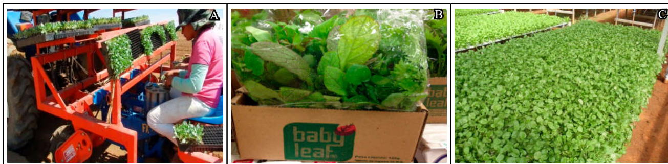
Figure 3. Mechanization (A), packaging (B) and protected cultivation (C) as a response to some of the challenges or constraints faced by growers and other agents of the production chain. Photos: Raphael Augusto de Castro e Melo. Brasília, Embrapa Hortaliças, 2019.

Different transformations can occur at various levels of this chain and, in this context, the compilation of different sources of data and case studies has enabled to capture changes and gain