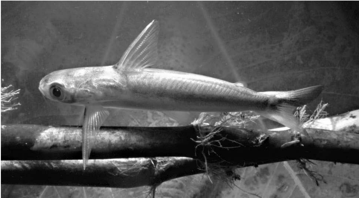
Figure 3. Lateral view of a driftwood catfish, Centromochlus heckelii , caught angling in the Solimões River, Central Amazon, Brazil (actual size 7.8 cm in total length). Note the long and sharp serrate spines of the dorsal and pectoral fins. Voucher specimen in the fish collection of the Natural History Museum, Universidade Estadual de Campinas (access no. ZUEC 6246).

within the wound (head, forearm, and leg) and the wound became infected and swollen. In 1 of these instances (forearm), the broken spine had to be surgically removed at a local hospital. Victims reported the intensity of the pain as varying from a local, quickly receding pain to a long-lasting (up to 1 hour) severe pain. One victim complained that the pain from a driftwood catfish sting was similar to that from a freshwater stingray (Potamotrygonidae) sting.