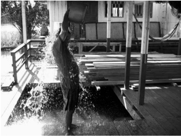
Figure 1. A riverside-dwelling person during bucket bathing at daytime in a floating house on the Solimões River, Central Amazon, Brazil. Note the position of the bucket and the water pouring (the bather holds his eyes shut during the process), as well as the typical clothing.

circumstances of the injuries, and the natural history of the catfish in order to describe these peculiar encounters between humans and catfish.