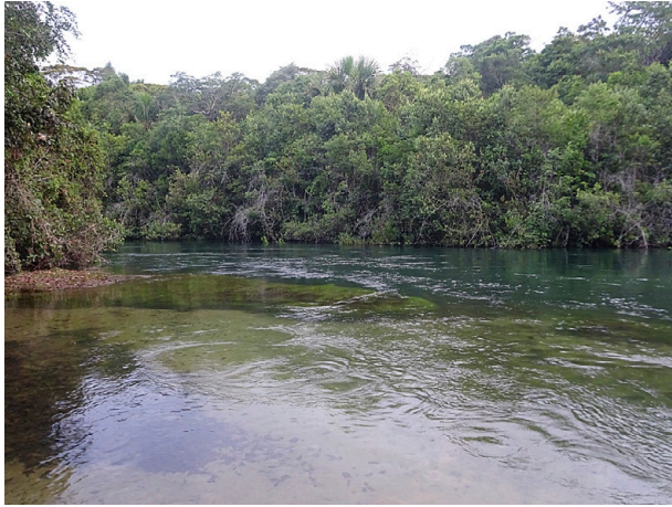
Figure 2. Sangue River in the Cerrado-Amazon transition, Campo Novo dos Parecis, Mato Grosso, Brazil.

given for the species (Campos et al. 2013) and within an area dominated by savanna vegetation in the Cerrado biome (Fig. 3).