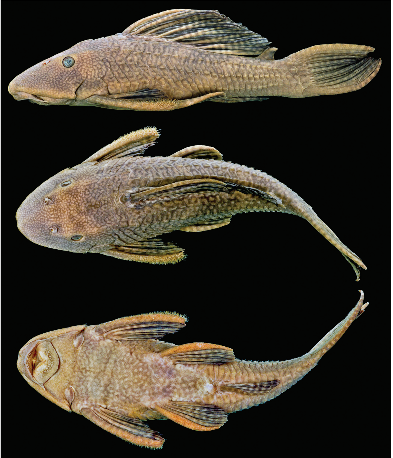
Fig. 1. Hypostomus delimai new species, INPA 6191, holotype, 235.2 mm SL, in lateral, dorsal, and ventral views, Pará, Itupiranga, rio Tocantins, Tocantins State, Brazil.

posterior process limited by five to eight (mode seven) predorsal plates. Plates limiting supraoccipital as part of complex arrangement of platelets (Fig. 3). Dorsal and lateral