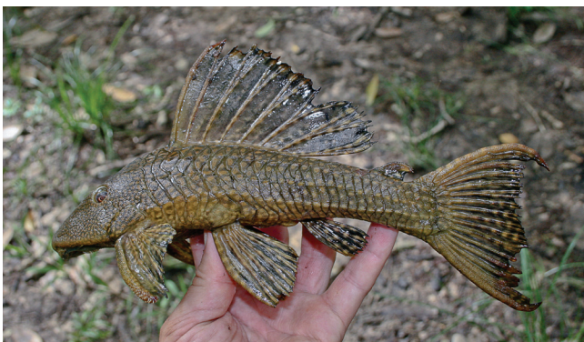
Fig. 2. Lateral view of Hypostomus delimai , NUP 11016, paratype, 176.7 mm SL, from the rio Lontra, rio Araguaia basin, in the border of Pará and Tocantins States, Brazil. Photographed immediately after capture.

Distribution and habitat. The species was found only in middle stretches of the rio Tocantins-Araguaia basin (Fig. 4). Records of the new species were done before the construction of Tucuruí dam in the rio Tocantins and in the rio Araguaia, in a habitat that soon will be flooded by the construction of the Santa Isabel dam. The rio Araguaia has about 2,627 km long, and its headwaters are located near the Emas National Park, southeast of the Goiás State, Brazil. The rio Araguaia flows northeast to a junction with the rio Tocantins near the town of São João do Araguaia in the State of Pará. These rivers have turbid water, rocky and sandy substrate, and variable