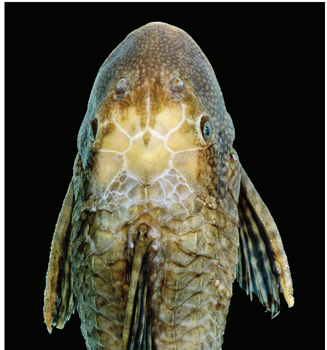
Fig. 3. Hypostomus delimai , INPA 2473, 167.1 mm SL, highlighting complex of platelets limiting supraoccipital and anterior portion of predorsal region. The skin of predorsal region was removed to evidence plate limits.

remnant riparian vegetation. The new species was found co-occurring, with Squaliforma cf. emarginata (Valenciennes, 1840), Hypostomus faveolus , Hypostomus cf. plecostomus (Linnaeus, 1758), H. pyrineusi (Miranda Ribeiro, 1920), and another putative undescribed species of Hypostomus .