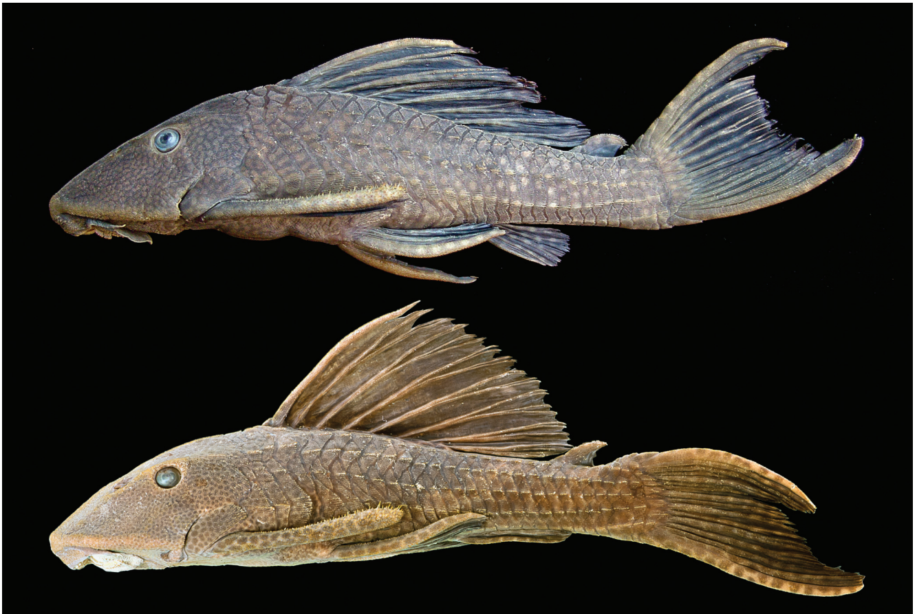
Fig. 5. Lateral view of preserved specimens of Hypostomus delimai NUP 11016, paratype, 176.7 mm SL (top); and H. hoplonites INPA 31849, 225.0 mm SL (bottom).

Considering the developed keels, the Amazonian species of Hypostomus with keels along the lateral series of plates are mainly known from the H. cochliodon species-group, such as H. ericius Armbruster, 2003 and H. oculus (Fowler, 1943), or