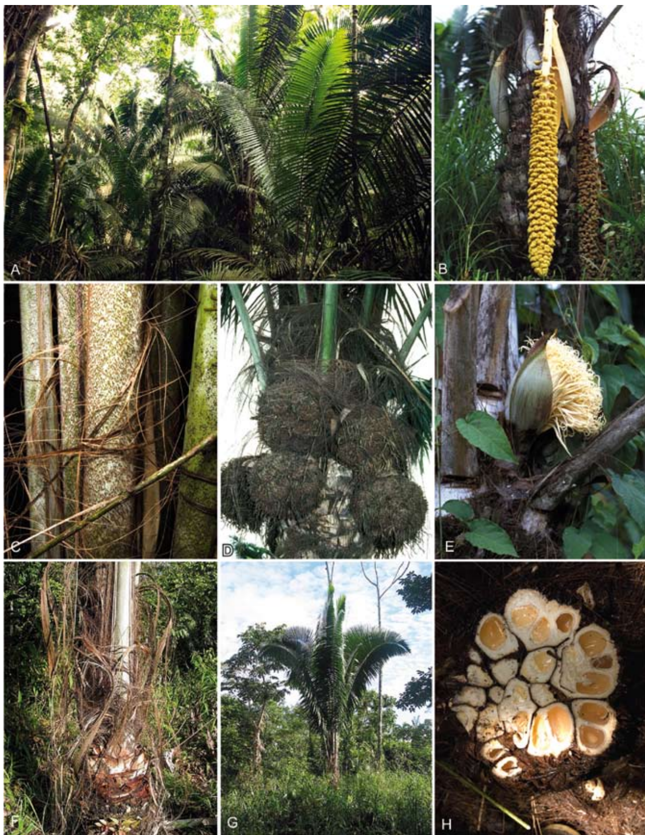
Figure 3. A. Stand of Aphandra natalia. B. Male inflorescence. C. Base of petiole with numerous brown scales. D. Infructescences. E. Female inflorescence. F. Leaf sheath with fibers. G. Single tree after harvest. H. Infructescence cut in half making the immature jelly-like endosperm visible. A, C, H: Rio Corrientes, Peru (2007). B, D, E: Sucua, Ecuador (1985). G, H: Rio Pastaza, Ecuador (2004).