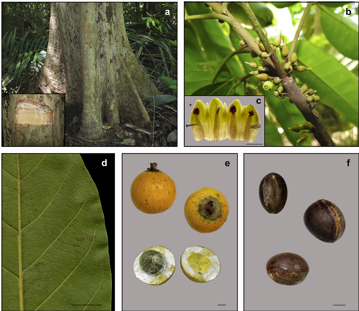
Figure 2. Field images of Pouteria franciscana . A. Buttresses and detail of bark slash. B. Floriferous branch showing leaf arrangement and inflorescences. C. Detail of open corolla showing the stamens and staminodes. D. Leaf venation. E. Fruit. F. Seed. Scale bars: 1 mm (C) and 1 cm (D, E, F).

brownish-ferruginous tomentulose. Flowers borne in fascicles, axillary or along the branches, 2–10 per fascicle, bisexual; pedicel 4.4–6.9 mm long, brownish tomentulose; sepals 4, 2.9–4.9 mm long (outer shorter than inner), orbicular-ovate, glabrous inside, brownish tomentulose outside, apex obtuse to acute, margin entire; corolla tubular, greenish, 3.8–6.0 mm long, sparsely strigose outside, glabrous inside; tube 5–6 mm long, 4-lobes, 2–4 mm long, orbicular, apex rounded to irregular, margin not ciliate; stamens 4, 4.8–6.6 mm long, filaments 4.2–4.6 mm long, fixed at base of the corolla tube, glabrous; anthers ca. 1 mm long, ovate, dorsifixed, extrorse and dehiscent longitudinally, glabrous; staminodes 4, 0.6–1.2, inserted between corolla lobes, lanceolate-subulate, papillate; ovary 4-locular, 0.8–1.3 mm long, ovate, whitish strigose trichomes; style 1.6–3.0 mm long, glabrous, usually exerted; stigma slightly 4-lobed. Berry, 37.1–75.7 g (fresh material), 3.8–5.0 × 4.2–5.3 cm, globoid; exocarp ca 5 mm thick, smooth, coriaceous, yellowish, usually appressed-tomentulose on surface, with lenticels brownish on apex and base; pulp fleshy,