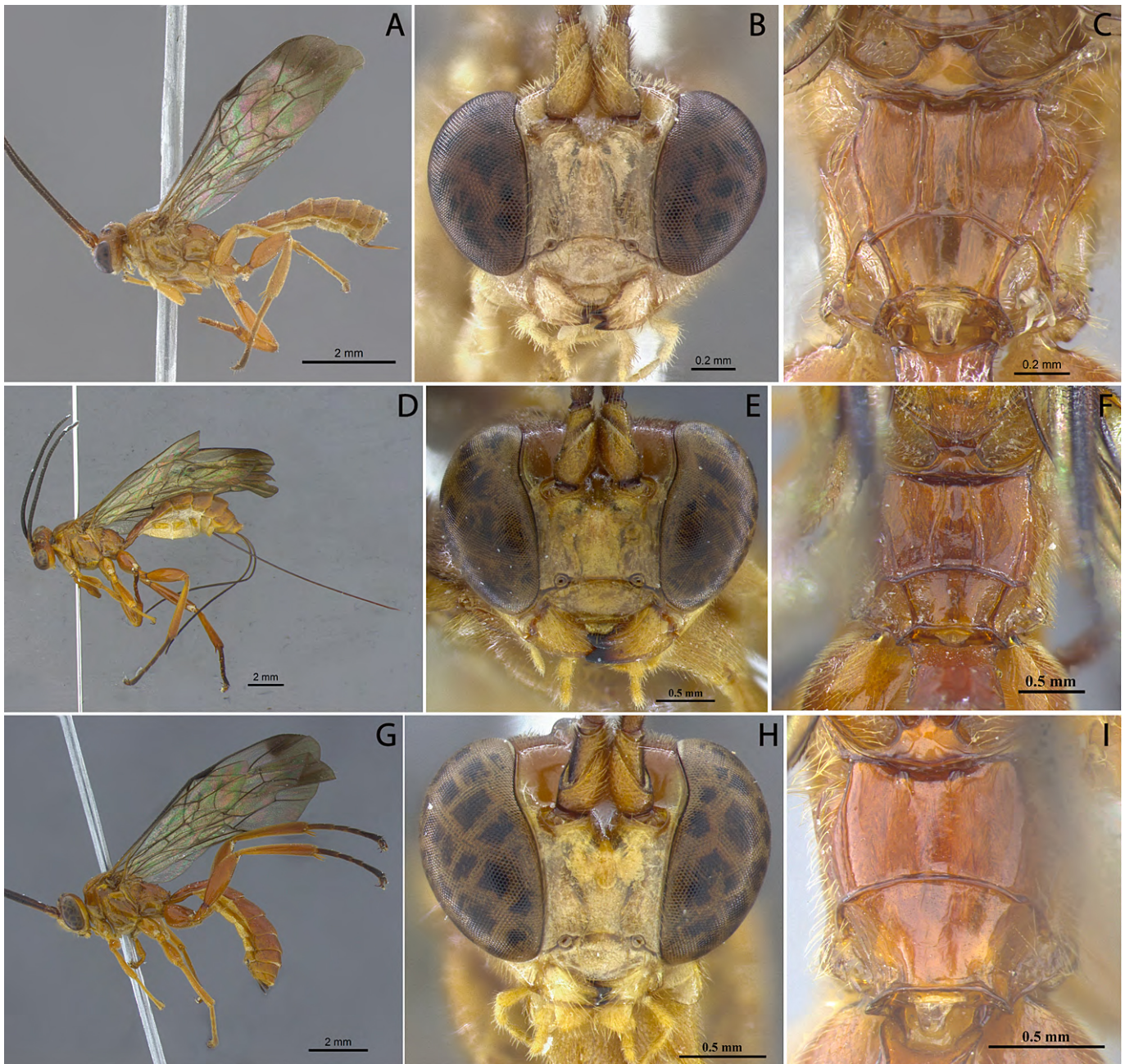
Figure 3. New records of the Neotheronia species from Brazil: A–C , N. charli , ♀: (A) habitus, lateral view; (B) face, frontal view; (C) propodeum, dorsal view. D–F , N. chersasi , ♀: (D) habitus, lateral view; (E) face, frontal view; (F) propodeum, dorsal view. G–I , N. lizae , ♀: (G) habitus, lateral view; (H) face, frontal view; (I) propodeum, dorsal view.

Neotheronia lloydi Gauld, 1991: Figure 2H Neotheronia lloydi GAULD (1991): 425.