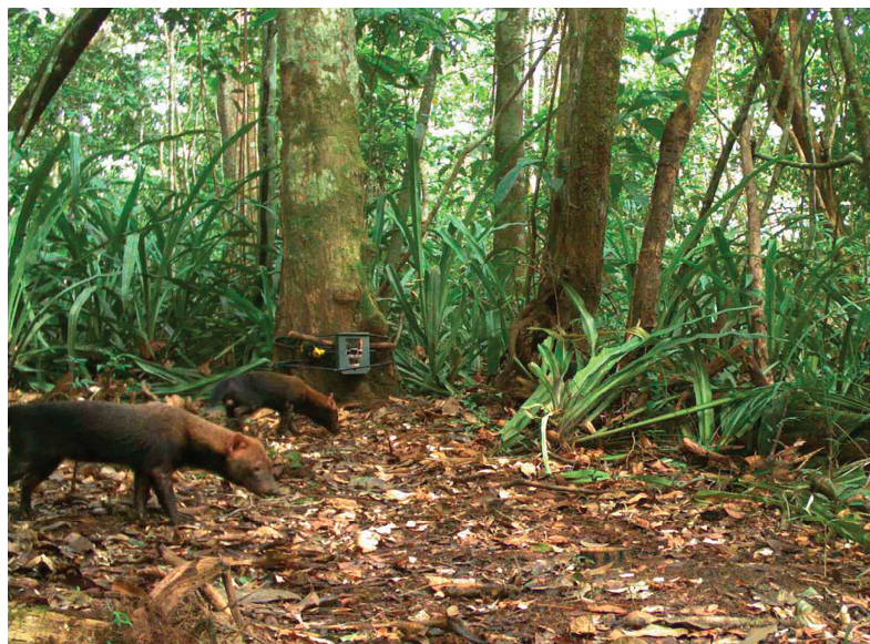
Fig. 3.—Two male bush dogs photographed by camera traps in Amanã Sustainable Development Reserve in January 2014.

Information about bush dog distribution, habitat use, and preferences are crucial to formulate conservation strategies for the species (Sillero-Zubiri et al. 2004). Since bush dogs are rarely seen or hunted in the Amazon (Dematteo 2008), we consider that understanding their ecology and the impact of diseases transmitted from domestic dogs are research priorities in Central Amazonia.