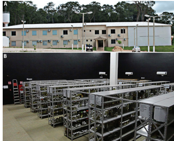
Figure 1. External view of the building of the Coleções Zoológicas e Laboratório Integrados (A) and internal view of the fish collection of the Universidade Federal de Rondônia (B).

five computers connected to a server for simultaneous cataloging of different lots. Labels are printed with indelible ink ( DuraBrite Epson ® ), which makes the text resistant to discoloration even when the label is immersed in liquid. The paper used for the manufacture of labels ( Resistall Paper ® ) has cotton fibers and is treated for longer durability and high humidity resistance.