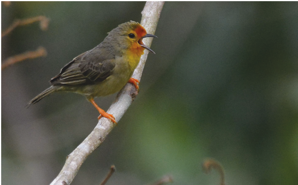
Figure 1. Orange-fronted Plushcrown Metopothrix aurantiaca , Careiro da Várzea, Amazonas, Brazil, 20 October 2018

Orange-fronted Plushcrown Metopothrix aurantiaca is a unique, small furnariid with bright plumage and tarsal coloration, distinct from other members of its family (Fig. 1; Remsen 2003). This warbler-like bird forages in pairs or small groups and often associates with mixed-species flocks, feeding mainly by gleaning arthropods from vegetation, even