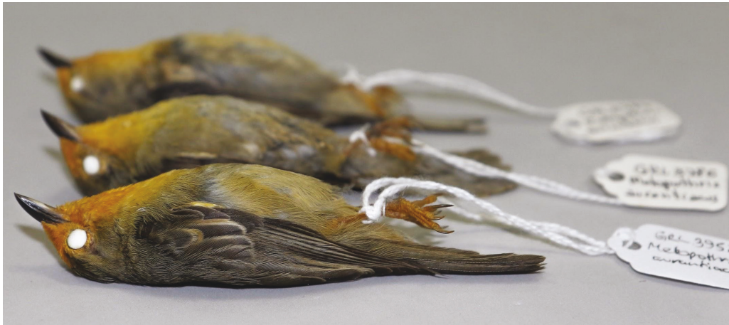
Figure 3. Recent Orange-fronted Plushcrown Metopothrix aurantiaca specimens collected in November 2017 west of Codajás, Amazonas, Brazil (two in background; GRL 3786, GRL 3787) and west of Manacapuru, Amazonas, Brazil (foreground; GRL 3952), housed at the collection at the Instituto Nacional de Pesquisas da Amazônia, Manaus

of Metopothrix was part of a cohesive mixed-species flock. The two birds remained high in the canopy of an emergent tree and neighbouring tall trees where mature várzea borders a strip cleared for sparse habitation. This area is c.800 m from the nearest large river and was not flooded at the time. We presumed the birds to be a pair as one (the putative male) had a much more saturated orange forehead and more vividly orange legs and feet ( http://www.wikiaves.com/2855507 ).