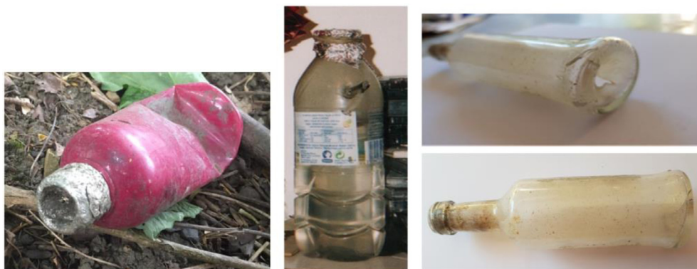
Figure 1. Makeshift pipes from bottles.