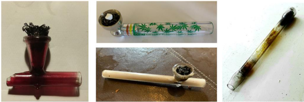
Figure 2. Glass pipes using stainless steel suspension devices, with crack and residue.

essential to maximise service engagement: pipe size and durability (small, strong and easy to conceal); provision of purpose fit gauze; good retention of crack residue (enabling reuse, see figure 2); familiarity and ease of use (does not require a change in smoking technique); and pleasure (does not diminish drug effect) (O’Heaire, 2013).