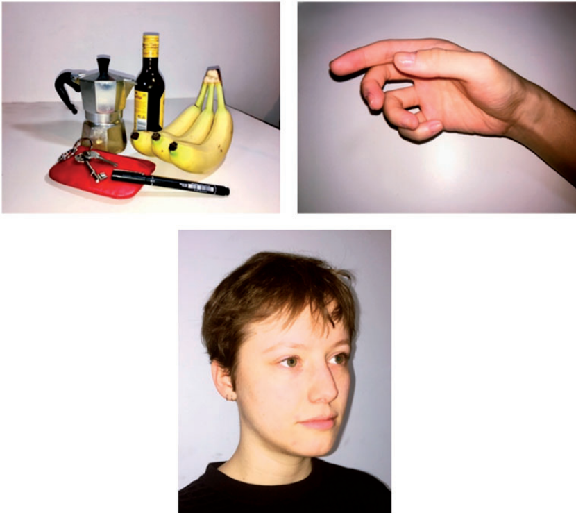
Figure 1. Stimuli of Representational Drawing Task Trials Produced by the Researcher. (Top left: still life photograph of everyday objects (752 × 564 mm), top bottom: photograph of a hand (752 × 564 mm), right: portrait (556 × 742 mm)).

presented during the experimental session was still life, hand, portrait for all participants. Each trial began with the presentation of a black fixation cross on a white background (Figure 2). This was followed by a free-viewing phase in which participants were instructed to simply observe the image displayed on the screen for 30 seconds. The free-viewing phase was then followed by a white screen with the instruction to begin the drawing phase. In the drawing phase, participants were instructed to produce a representational drawing of the image shown on a A4 (297 × 210 mm) paper with sharpened 4B pencils and erasers. The instruction given to the participants for the drawing was simply to ‘produce a representational drawing’, without any limitation on method of depiction or techniques used. Participants were given 10 minutes per stimulus to complete the drawing but were also permitted to move to the next trial before the 10-minute trial limit had elapsed. The time at which each participant finished drawing in each trial was recorded.