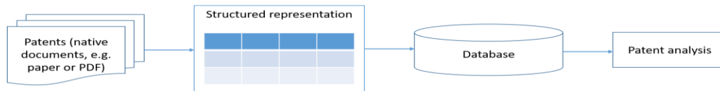
Figure 1. The patent representation and analysis workflow

automated patent analysis, based on different principles and approaches: visualization, citation analysis and text mining, each using different techniques, such as Natural Language Processing, semantic analysis, property-function analysis, and so on [4]. Regardless of the approach, all patent analysis systems follow the same workflow, sketched in Figure 1. First, patents data — in form of structured representation — is stored in a database. Then, a suitable patent analysis is carried out, by means of the available querying/mining capabilities of the database.