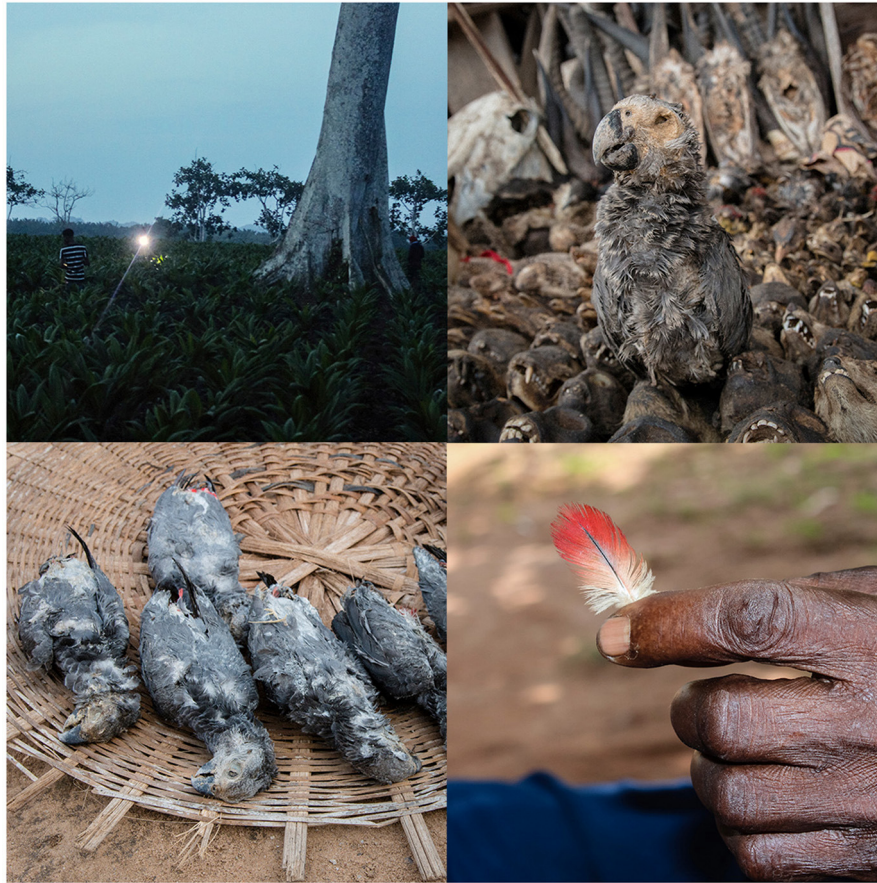
FIGURE 3 | Top left—image of people searching for feathers under a parrot roost in Nigeria (Rowan Martin/World Parrot Trust); top right and bottom left—images of Grey parrot ( Psittacus erithacus ) intended for commercial sale, Togo, West Africa (Neil D’Cruze/World Animal Protection); bottom right Grey parrot tail feather in Nigeria (Rowan Martin/World Parrot Trust).

Some aspects of the trade in Grey parrot body parts might be entirely sustainable and potentially support conservation and be non-detrimental for animal welfare. For example, the scarlet red tail feathers of Grey parrots are gathered by local people from beneath roosts in Nigeria and it has been suggested that trade in tail feathers may provide important incentives for communities living near to roosts to protect parrots from trappers. However, recent surveys in Nigeria have found that roosts that were used in this way in the early 2000’s are no longer present (Ezenwa et al., 2019) suggesting that current market structures do not lead to site protection as a result of sustainable use. As this study has illustrated, the value of tail feathers is often very small compared to the live bird or other body parts, and it is not clear whether there may be any models of sustainable harvest of feathers from beneath roosts that could yield conservation benefits. Furthermore, while gathering of feathers from beneath roosts provides a small income for communities living near to roost sites, this practice is only sustainable if there are healthy Grey parrot populations in the wild (Ezenwa et al., 2019).