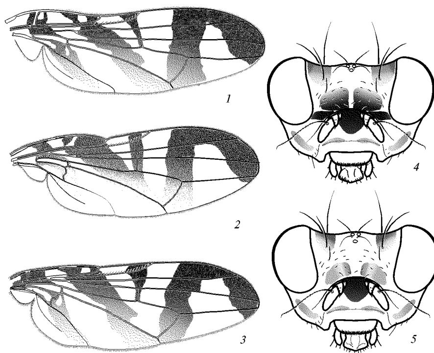
Fig. 2. Plagiocephalus , female: 1-3 — wing: 1 — P. latifrons ; 2 — P. lobularis ; 3 — P. intermedius ; 4-5 — head: 4 — P. latifrons ; 5 — P. intermedius .

Рис. 2. Plagiocephalus , самка: 1-3 — крыло: 1 — P. latifrons ; 2 — P. lobularis ; 3 — P. intermedius ; 4-5 — голова: 4 — P. latifrons ; 5 — P. intermedius .