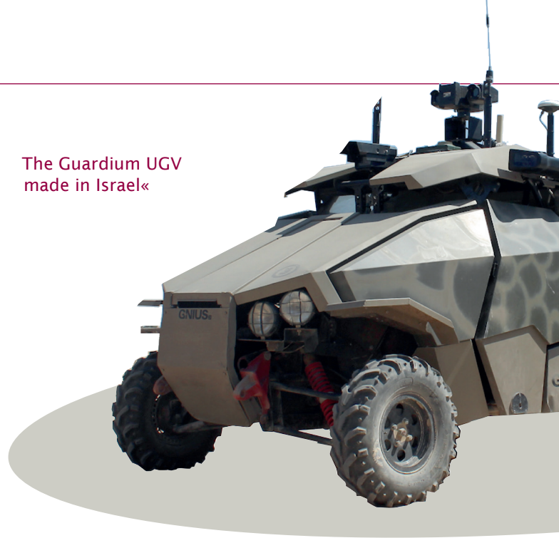
The Guardium UGV made in Israel«

side using AWS would always run the risk of retaliatory measures or even escalation with an uncertain outcome. Particularly for the nuclear weapons states among themselves, this risk of escalation would seriously argue against a deployment of AWS that is intended as locally limited.